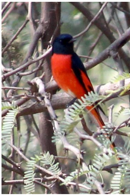
Long Tail Minivet